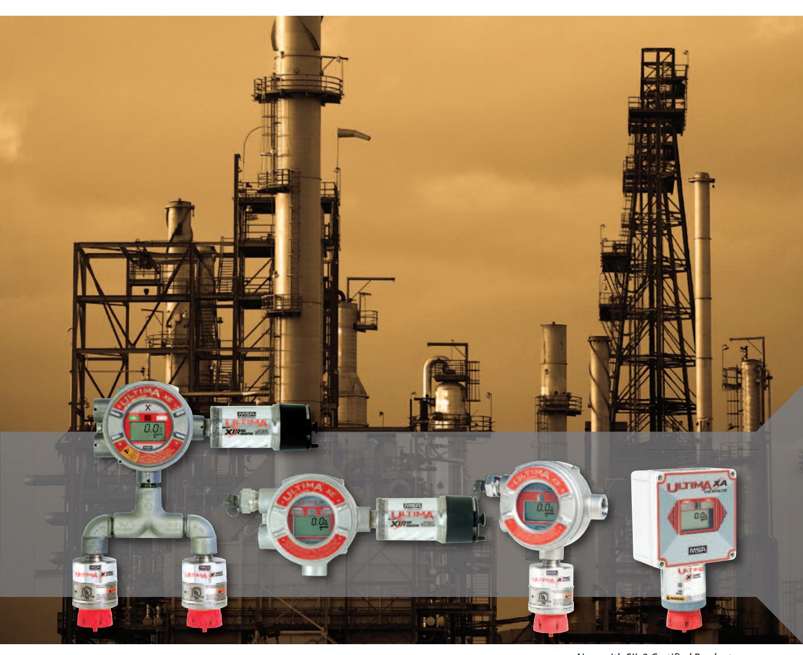
Now with SIL 2 Certified Products

MSA's Ultima X Series Gas Monitors are microprocessor-based transmitters engineered with the customer in mind. Utilizing DuraSource Technology for extended sensor life, the monitors are available in either stainless steel or polycarbonate enclosure housings.